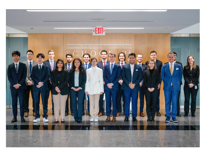
GW Phillips Stock Pitch Day Class Photo, Fall 2022